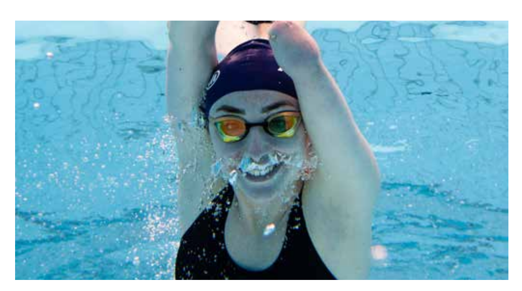
Ellen Keane Irish Paralympic swimmer

Additionally, we accept drivers holding Ukrainian driving licences on existing and new car insurance policies; provide cover for both Ukrainian registered vehicles and Irish registered vehicles; acknowledge prior driving experience; honour no claims