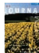
Cover Picture: A field of daffodils in the spring.

This year's Junior Achievement Awards winners.