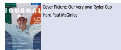
Cover Picture: Our very own Ryder Cup Hero Paul McGinley