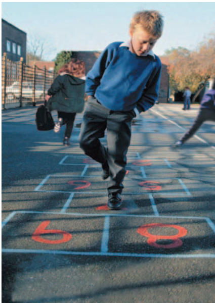
Cover of our Custodian School Protection Policy

This article considers the unique position achieved by Allianz as Ireland's pre-eminent insurer in the education and related insurance market. We outline how we have served the insurance needs of schools throughout Ireland down through the years and offer the case for maintaining and further developing our long standing and valued relationship with you against the background of an increasingly more competitive financial services sector.