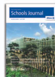
Allianz House in Elmpark

We have moved! Our new address is Allianz House, Elmpark, Merrion Road, Dublin 4, Ireland